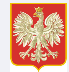
Coat of arms 1927-1939

The 2nd Polish Republic was short-lived. On 24 August 1939, pre-planned by Russia and Germany, the notorious and infamous Molotov-Ribbentrop pact was signed, dividing Poland – the Fourth Partition. Following the German invasion of Poland on 1 September 1939, Russia invaded Poland on 17 September 1939, immediately starting the de-Polonisation of occupied lands.