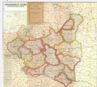
Boundaries of the 2nd Polish Republic 1918 - 1939

Formed out of the chaos of the First World War approximately 400,000 soon-to-be Polish citizens died fighting for Poland's three partitioning powers. On 11 November 1918, now celebrated as Independence Day, Marshall Piłsudski assumed control of the Polish forces, proclaimed an independent Polish state and went on to form a new national government.